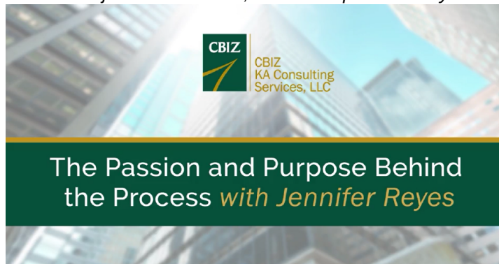
The Passion and Purpose Behind the Process - Jennifer Reyes

Click below to check out our latest video to learn about the personal approach that our CBIZ KA team applies to ensure that solutions we provide address specific hospital needs. Patient advocacy drives our team to go above and beyond. Not just for our clients, but for the patients they serve.